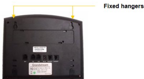
Figure 3: Location of the fixed hangers on GXP2010

To use the handset, pull out the tab (extension downward) from the handset cradle, rotate the tab and plug it back into the slot with the extension up to hold the handset.